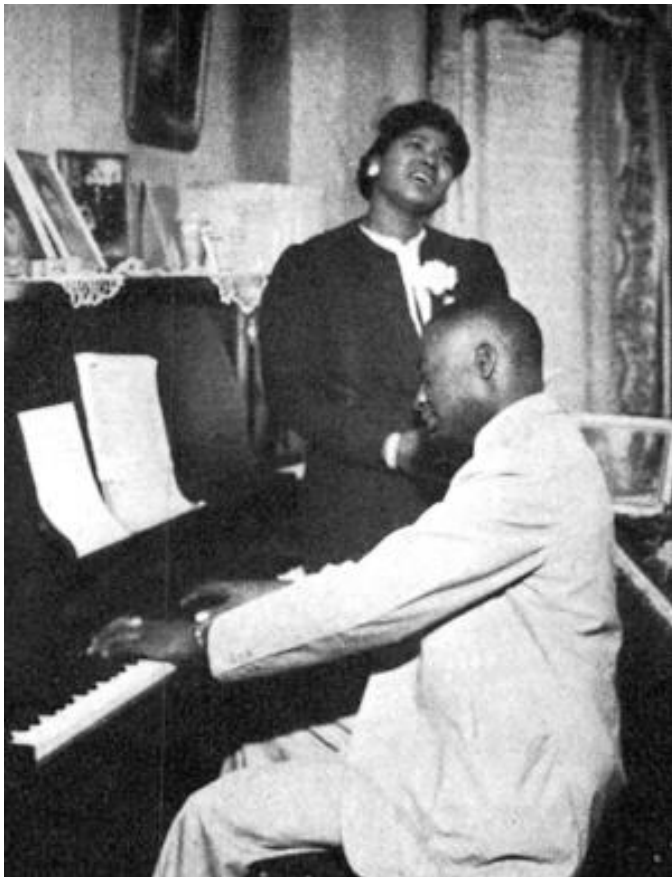
Mahalia Jackson and Thomas Dorsey